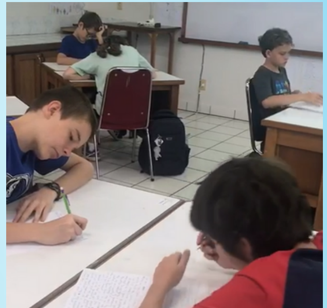
MIDDLE SCHOOLERS HONING THEIR WRITING SKILLS SISWA SMP MENGASAH KETERAMPILAN MENULIS MEREKA