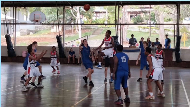
HIGH SCHOOL BASKETBALL GAME PERTANDINGAN BASKET SMA