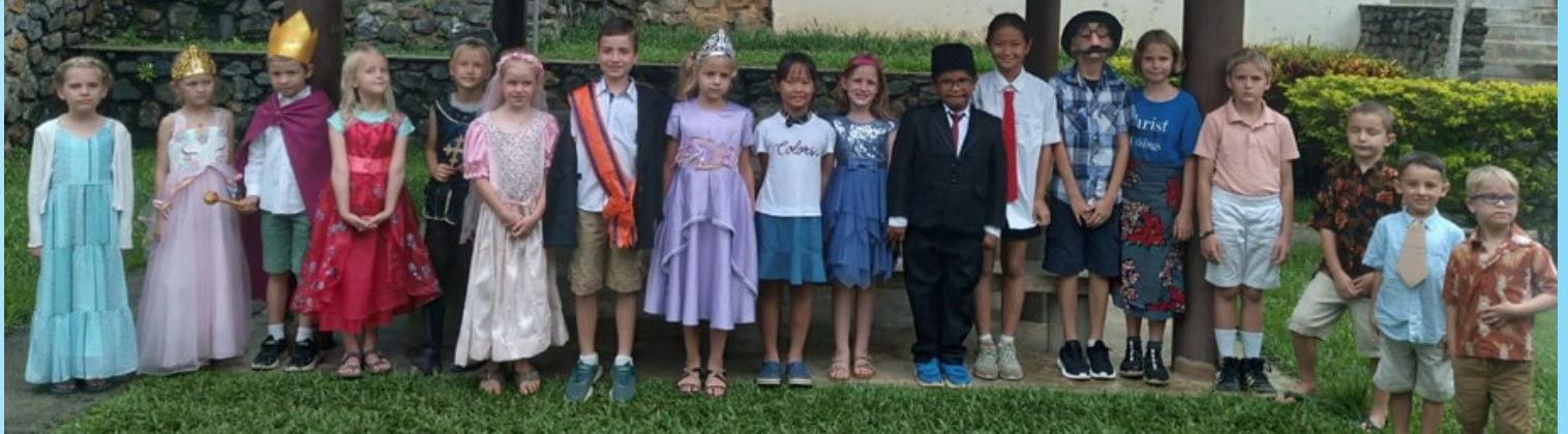
ELEMENTARY WORLD LEADERS FUN FRIDAY JUMAT MENYENANGKAN SD PARA PEMIMPIN DUNIA