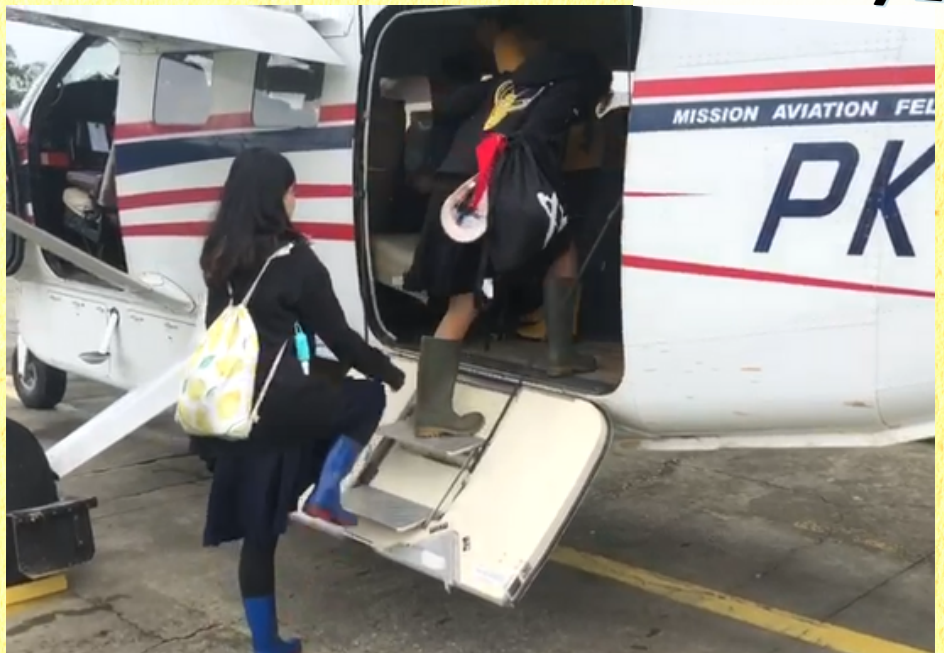
HIGH SCHOOLERS ARE ON THEIR WAY! SISWA SMA DALAM PERJALANAN!

E/MS Half Day of School, Basketball and Grade 9 Meal (SD/SMP Sekolah Setengah Hari, Permainan Bola Basket dan Makanan Kelas 9)