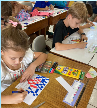
3RD GRADE ART CLASS KELAS SENI KELAS 3