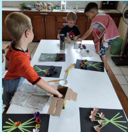
PRE-1ST CLASS ART CLASS KELAS SENI KELAS PRA-1