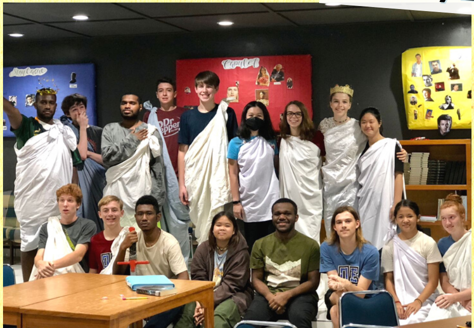
STUDYING SHAKESPEARE BELAJAR TENTANG SHAKESPEARE

Half Day - Teacher Inservice ( Setengah Hari - Pengembangan Guru )