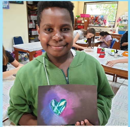
6TH GRADE ART CLASS KELAS SENI KELAS 6