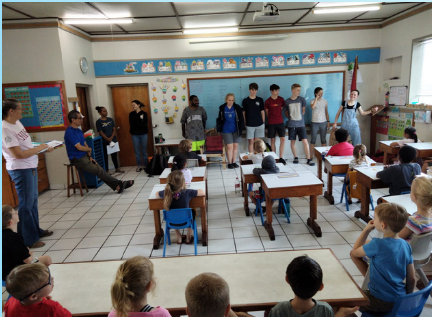
OE GROUP AT 1ST GRADE CLASSROOM GRUP OE DI RUANGAN KELAS 1