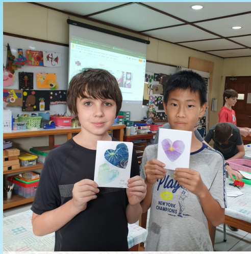
7TH GRADE ART CLASS KELAS SENI KELAS 7