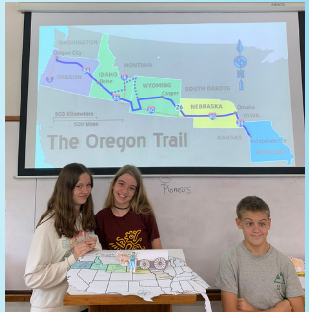
8TH GRADE THE OREGON TRAIL PROJECT PROYEK JEJAK OREGON KELAS 8