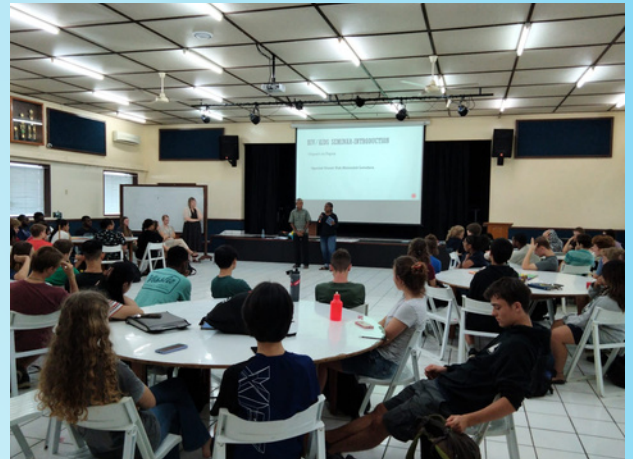
HIV/AIDS SEMINAR SEMINAR HIV/AIDS