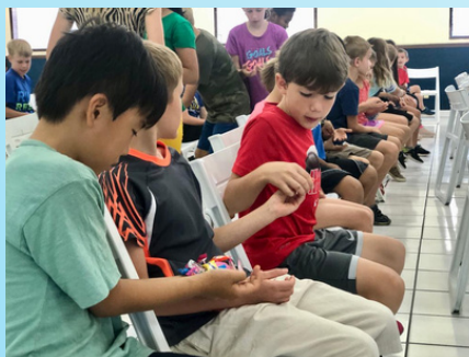
SHARING WITH EACH OTHER SALING BERBAGI