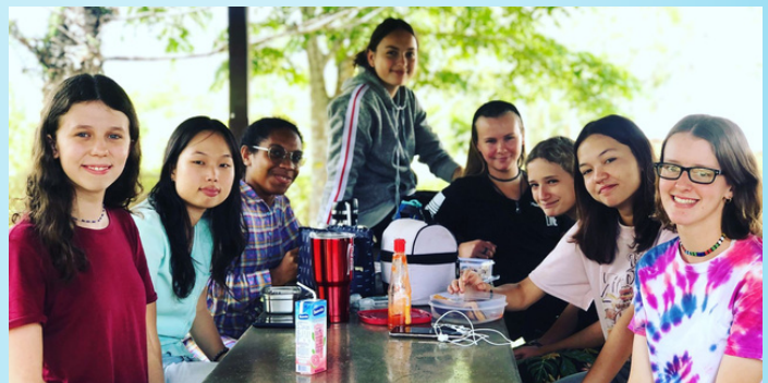
SENIOR LUNCH BREAK ISTIRAHAT MAKAN SIANG SENIOR