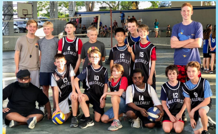
BOYS VOLLEYBALL C TEAM TIM BOLA VOLI C PUTRA

Students in grades 10-12 are able to sign up for SAT and ACT college entrance exams through the websites: www.collegeboard.org & www.myact.org . HIS does not require these tests, but we recommend them to students who are interested in university outside Indonesia. Siswa di kelas 10-12 dapat mendaftar untuk ujian masuk perguruan tinggi SAT dan ACT melalui situs web: www.collegeboard.org dan www.myact.org . HIS tidak mewajibkan tes ini, tetapi kami merekomendasikannya kepada siswa yang tertarik dengan universitas di luar Indonesia.