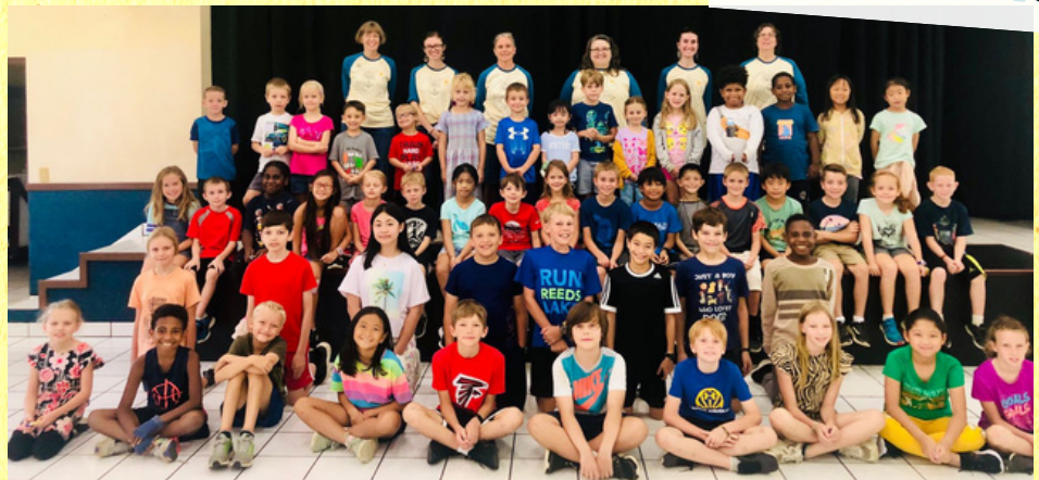
HILLCREST ELEMENTARY SD HILLCREST

Futsal Games and Freshmen Meal (Permainan Futsal dan Makanan Kelas 9)