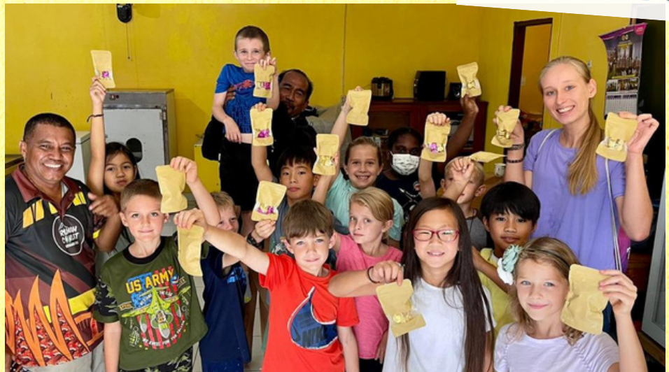
3RD GRADERS ENJOYING A FIELD TRIP TO THE CHOCOLATE FACTORY ANAK-ANAK KELAS 3 MENIKMATI KARYAWISATA KE PABRIK COKLAT

Dear Hillcrest Community, Komunitas Hillcrest,