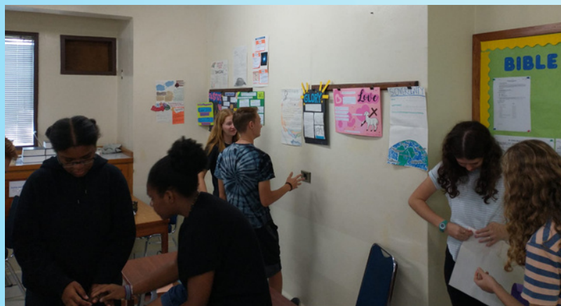
ENJOYING GRADES 11 DAN 12 BIBLE PROJECTS, THE ATTRIBUTES OF GOD MENIKMATI PROYEK-PROYEK ALKITAB KELAS 11 DAN 12, ATRIBUT-ATRIBUT TUHAN