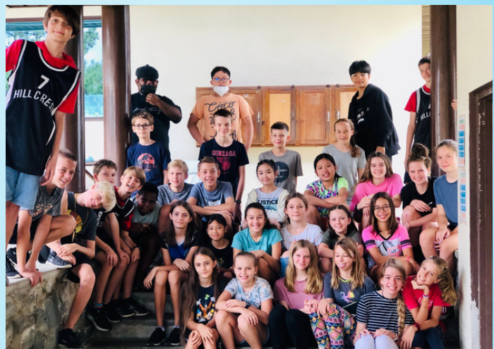
AMAZING MIDDLE SCHOOL STUDENTS SISWA SMP YANG LUAR BIASA