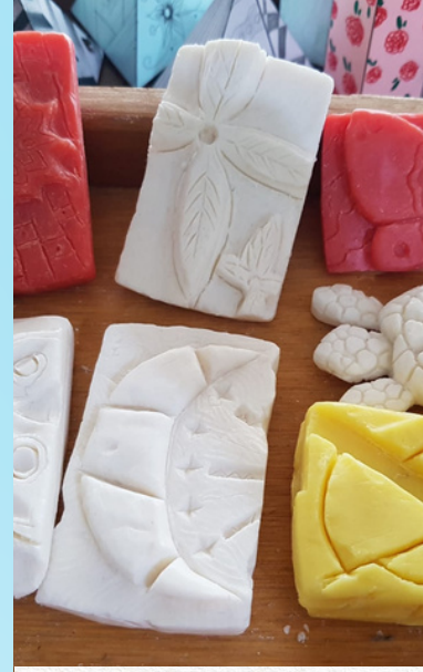
SOAP CARVINGS IN HS ART MENGUKIR SABUN DI SENI SMA

IF YOU NEED TO SEE HIS ACADEMIC CALENDAR , PLEASE CLICK HERE.