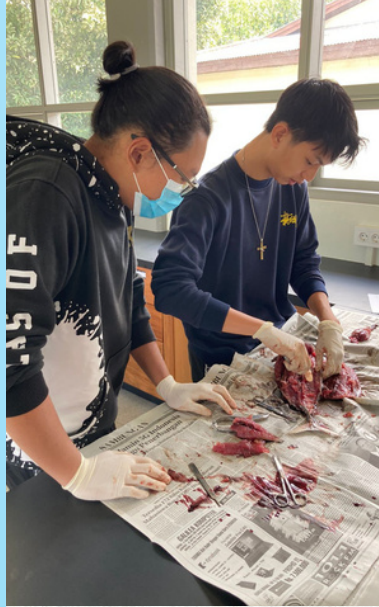
FISH CARVING/DISSECTION IN BIOLOGY MENGIRIS/MEMBEDAH IKAN DALAM BIOLOGI

Perlu diingat bahwa protokol kesehatan pemerintah tetap mewajibkan kita memakai masker di gedung sekolah saat ada sekelompok orang berkumpul. Artinya, semua pelajar dan orang dewasa tetap harus memakai masker. Juga tetap penting untuk mengikuti aturan kesehatan sekolah. Anda dapat meninjau aturan dengan memeriksa halaman terakhir surat ini. Terima kasih telah membantu kami menjaga siswa dan staf tetap sehat!