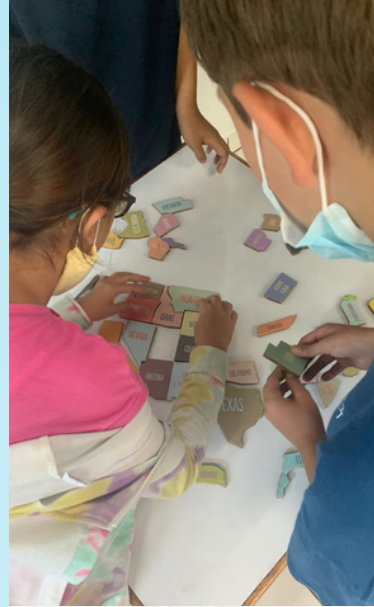
UNITING THE US STATES IN MS SS MENYATUKAN NEGARA BAGIAN AS DI IPS SMP